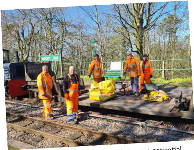
The Thursday gang enjoy the sun between essential tasks.