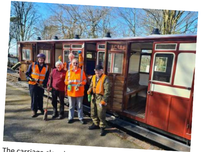
The carriage cleaning team at Woody Bay.