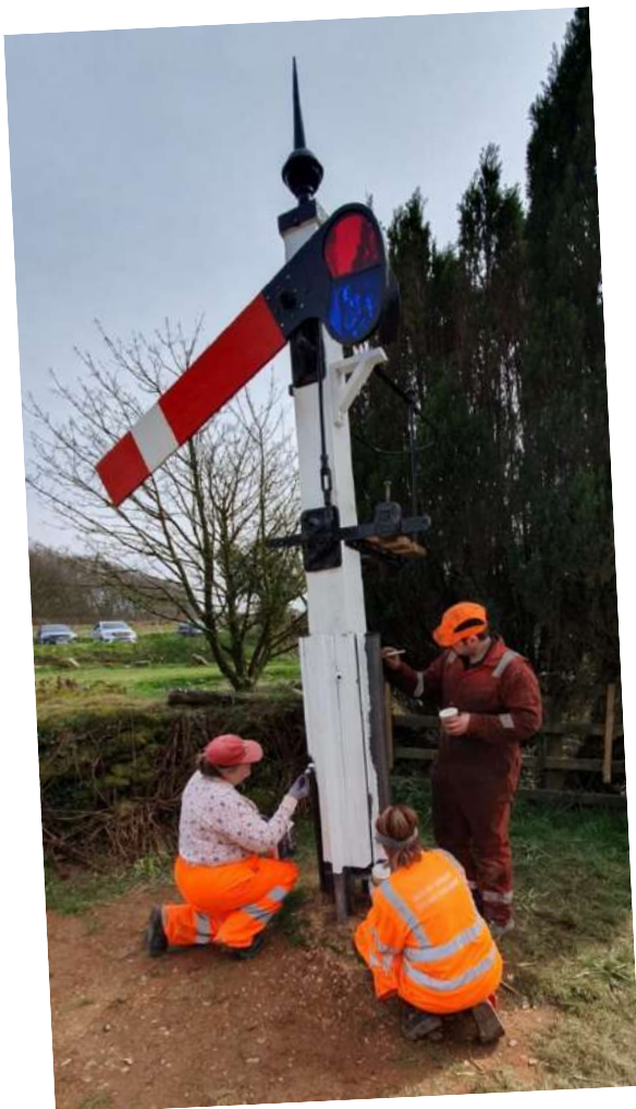
The finishing touches are made to the signal at the Old Station Inn.