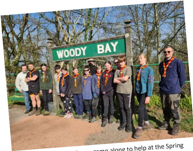
The 1st Exmoor Scout Group came along to help at the Spring Work Weekend.