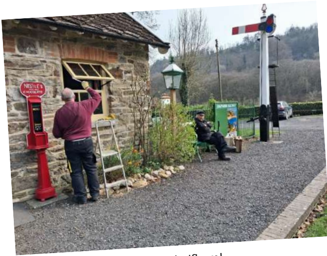
Maintenance never stops at Chelfham!