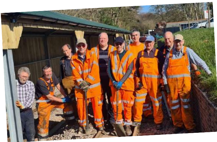
Pride in a job well done!