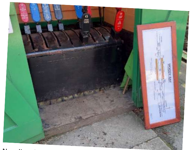
New line diagram ready for installation at the Woody Bay signal cabin.