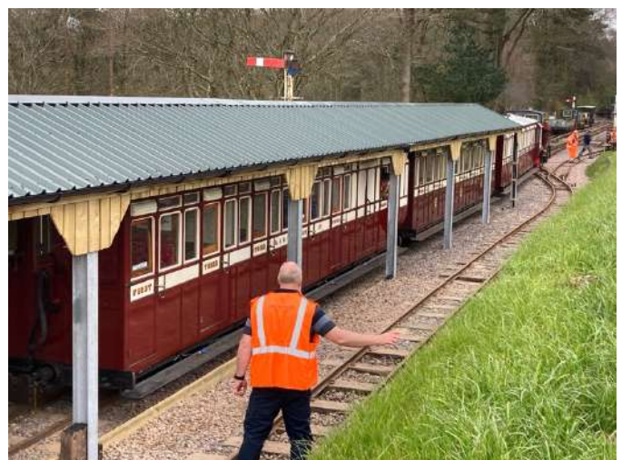
Gleaming carriages are reversed into the new carriage shelter.