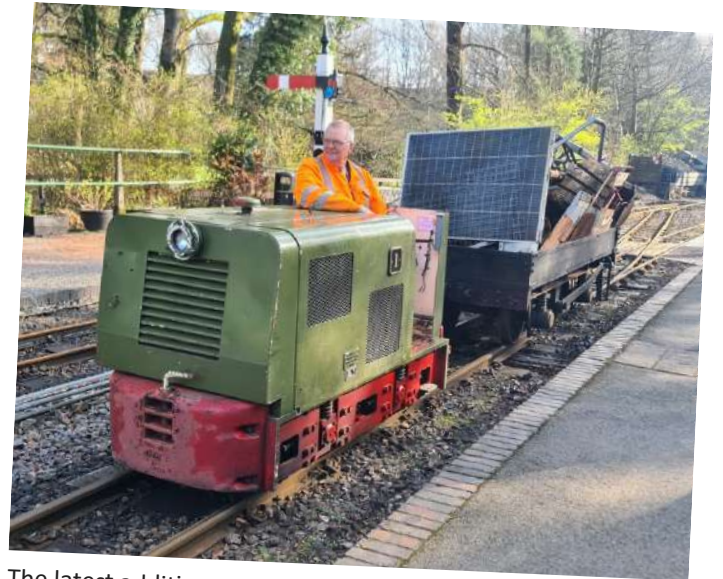
The latest addition to the fleet, Hunslet prototype no. 001, hauls a scrap train at Woody Bay.